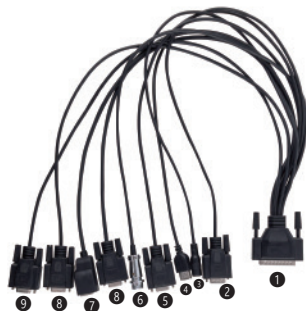
Pigtail Connecting Cable